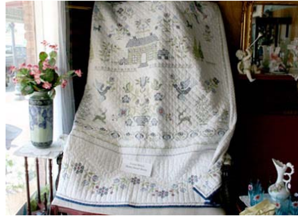
This cross-stitch quilt, entitled 'Home Sweet Home,' blends nicely with the décor of Rowand's Mini Mall.

On Saturday, a car show will be hosted in the parking lot in front of the Columbia County Courthouse Annex.