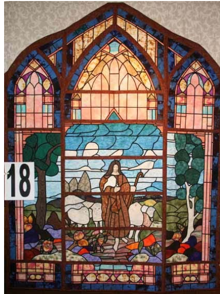
Teddy Pruitt creates the illusion of a stained-glass window with this quilt.